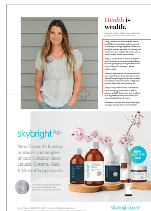
Half Page Advert Example