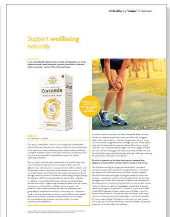
Promotional Page Example